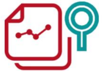
Data & Research